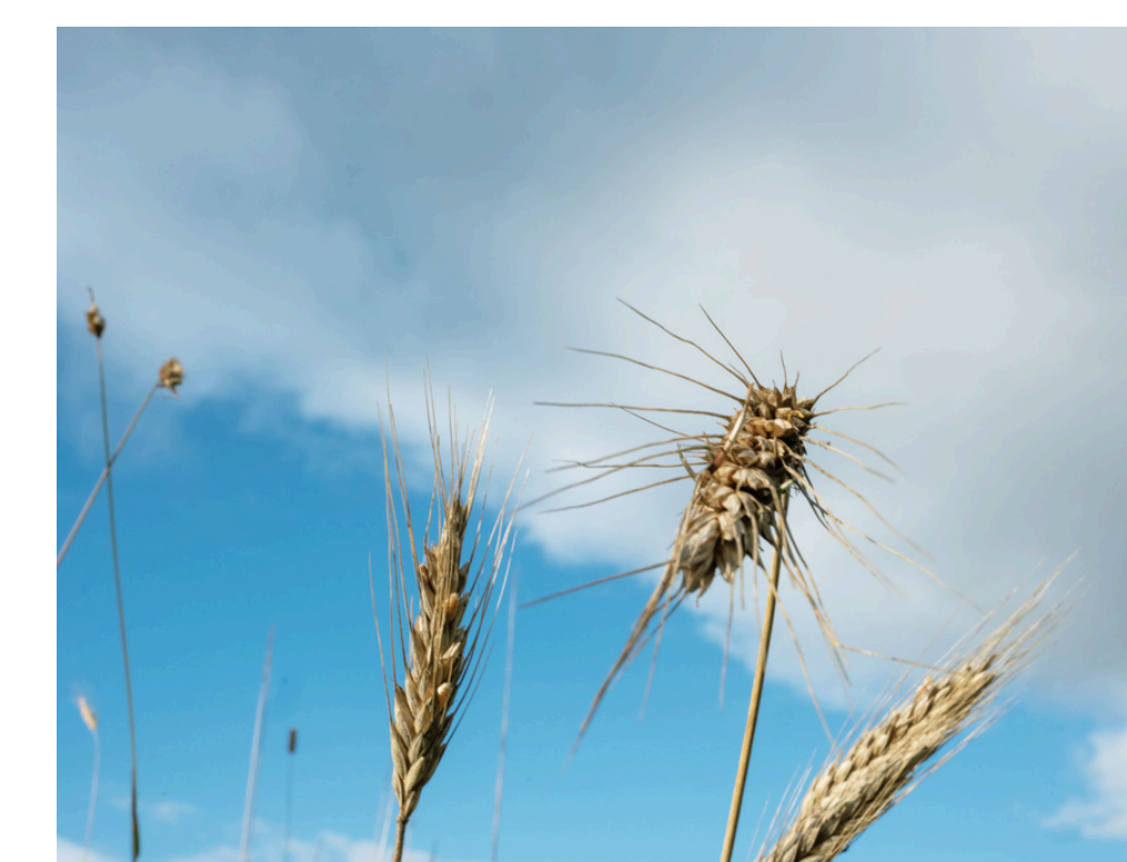
Trial plots at Gotherley Farm, Somerset, photographed by Lúa Ribeira.